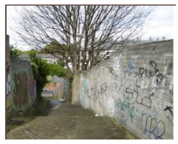
Figure 1 Existing steps

Cameron Sq step upgrade includes a major refurbishment of current steps including the resetting of new steps on existing ones, the removal of current wall on the hospital side opening up the landscaped garden and the inclusion of lights.